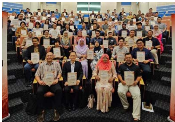
10 th Year Celebration - MTS Spirometry Training and Education, 14 May 2023