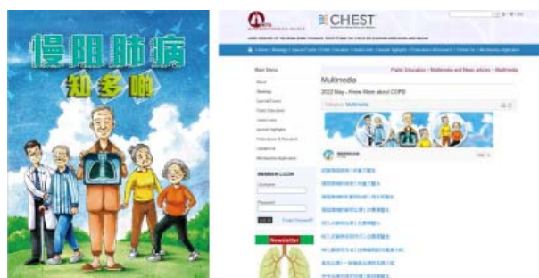
Soft copy of the COPD patient information booklet can be accessed at the website of Hong Kong Thoracic Society. ( hkts.hk ).