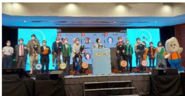
The official mascot “Wise Mike” met guests at the kick-off event.

The Hong Kong Thoracic Society is a supporting organization of the Hong Kong Council on Smoking and Health (COSH)’s publicity programme “Tobacco Endgame: Zero Hazard • Smoke-free Generation”. The programme echoed the World Health Organization’s “World No Tobacco Day” on 31 May, drawing global attention to the tobacco epidemic and the preventable death and diseases it causes. The HKTS joined the kick-off event held in collaboration with the Radio Television Hong Kong on 24 May 2022. The “Smoke-free Sportswear Day” activity was the highlight of the programme to create a social atmosphere for smoking cessation. A healthy, smoke-free lifestyle was promoted through wearing sportswear and doing exercise on 31 May 2022.