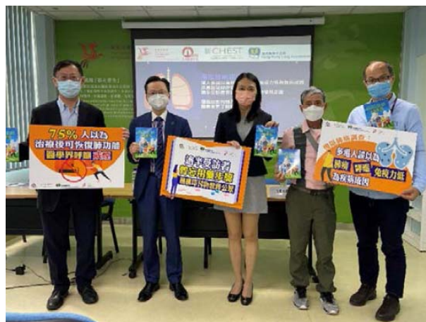
Joint press conference with the Community Rehabilitation Network of the Hong Kong Society of Rehabilitation on 25 May 2022

Hong Kong Thoracic Society collaborated with the Hong Kong Society for Rehabilitation (HKSR) Community Rehabilitation Network (CRN) to launch a COPD Public Awareness Campaign. A survey of the public on their knowledge of COPD was conducted, and a COPD patient information booklet was published. Content of the booklet included causes and symptoms of COPD, diagnostic tests and treatments available, prevention of the disease as well as practical tips for patients and their carers. On 25 May 2022, Presidents of the HKTS and the CHEST Delegation Hong Kong and Macau, and Chairman of the Hong Kong Lung Foundation attended a joint press conference with CRN to report results of the survey and announced the publication of the booklet.