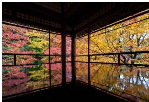
Kyoto in autumn, the time of the conference

excretion from fossil fuel combustion in airplane flights. Consider eliminating printed materials and bags, minimizing signage and displays, using locally produced and consumed food, using vegetables and meat raised using farming and animal husbandry methods that minimize carbon dioxide and methane emissions as much as possible, using fair trade products, reducing food loss, and banning the use of plastic containers. Furthermore, priority will be given to companies that contribute their operations to the achievement of the sustainable development goals (SDGs). As for the conference management, programme organization and presentation, in addition to doctors with rich experience, early career doctors and female doctors will be given the opportunity to speak freely and manage the conference. They are a rich source of ability and create the future. I know that there are many arguments for promoting women's participation, and I would like to positively discuss them. Traditions and systemic barriers to the advancement of young people and women should be removed. Over the past few decades, we have learned how diversity contributes to the advancement of medicine in all fields of practice, research and education. Now is the time to seriously create an environment of equal opportunity and career development for all. APSR 2021 welcomes active discussions on women's leadership and career development. We also welcome to discuss gender-based scientific research in medicine.