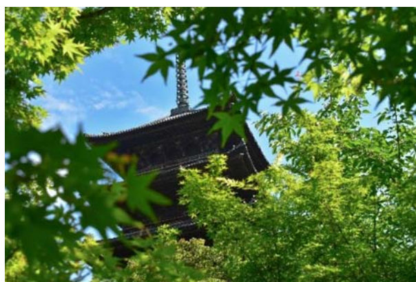
Kyoto in Summer, Now

to the on-demand virtual platform, open until December 2021 (tentative). For APSR 2021, in addition to the regular programme about respiratory medicine, we are planning various programmes in accordance with the theme of the congress, "Our Future". We are planning a symposium organized by young doctors called "Emerging Talent Symposium" to nurture and encourage them, a symposium discussing why coronavirus disease 2019 (COVID-19) occurred and spread, a symposium to discuss the latest topics on the pathogenesis of COVID-19, and a symposium discussing career plans that can provide all individuals with equal opportunity.